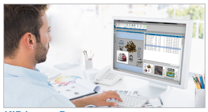
KIP Image Pro One Application for all Wide Format Imaging

Smart Tablet Simplicity 12" Ultimate Color Display to Copy, Print and Scan with Vivid Color Image Previews and Intuitive Feature Selection for Easy Operation.