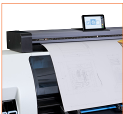
SD One MF is light enough to be placed on any flat surface like a printer.

Perfect for situations where you need to allocate costs, SD One MF has integrated print management software, allowing you to track the cost of every scan, copy or print.