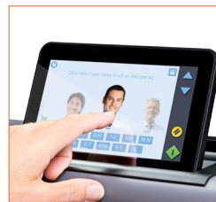
Browse user profiles on the SD One MF and scan direct to preset destinations unique to each user.