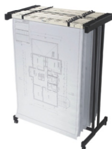
ECO mobile stands