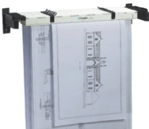
ECO wall racks