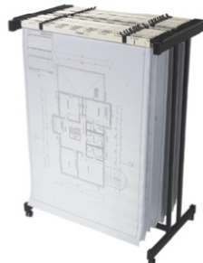
ECO mobile stands