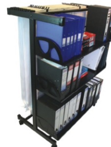
ECO combi mobile Est. 1991