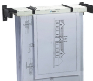
ECO wall racks