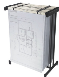
ECO mobile stands Est. 1991