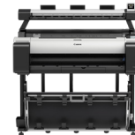
TM-300 MFP L36ei