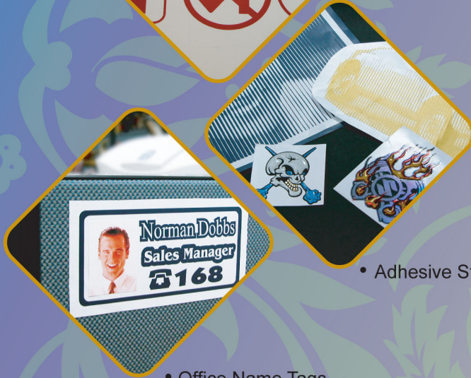
• Adhesive Stickers