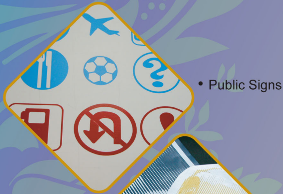
• Public Signs