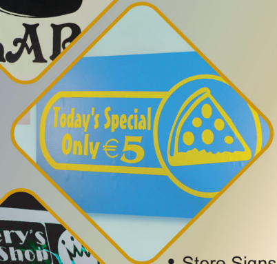
• Store Signs